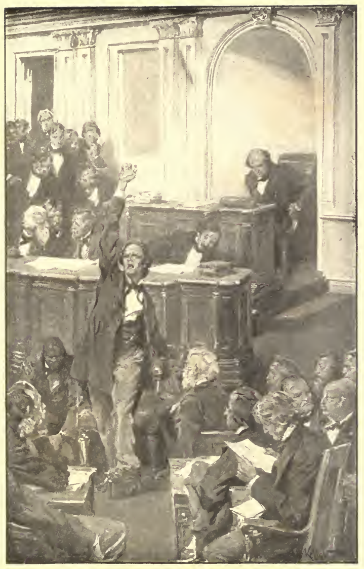
"'I hurl the everlasting curse of a Nation-"